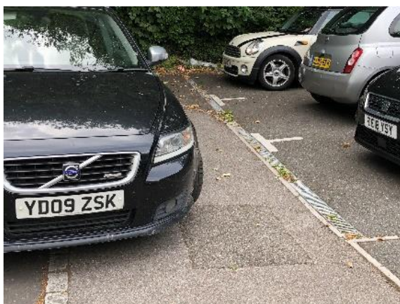
3rd July 2020 3.30pm- Cars blocking pavement outside of the Vets on the East side of the Deneway.