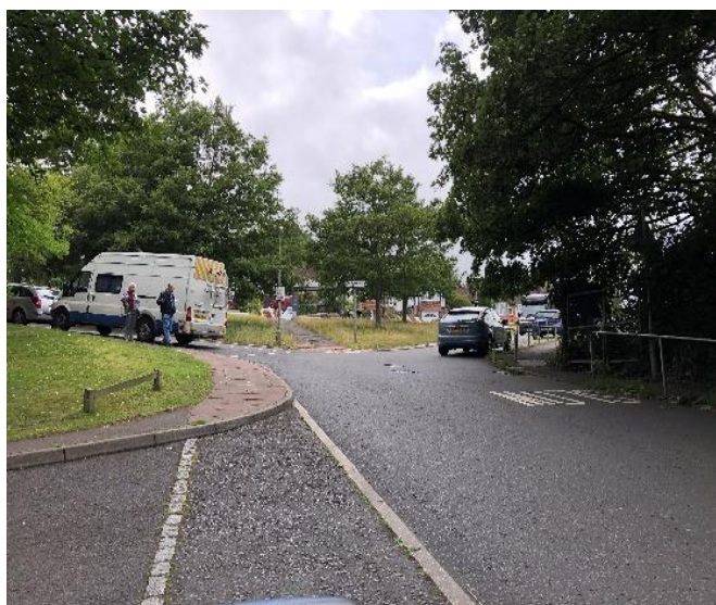
3rd July 2020 3.30pm- Cars parked on corners of the west side of The Deneway at Lionsdene crossing point as the road forks.

The Deneway is approximately 150m long on the east side, and 100m long on the west side. It is short and complex. The east side has a roundabout and bends narrowing to single track under the railway bridge. The west side rises up from the bridge, on a sharp hill before forking into two sections that continue to rise to the junctions at Eldred Avenue. Both the west side forks effectively become single track due to parking and verges are decimated due to cars coming off the road to avoid colliding with oncoming traffic. Due to its width and design, in significant sections pavements are only on one side, meaning most pedestrians walking the short length of The Deneway will have to cross the road at least once. Until recently there were no road markings along any section of this road.